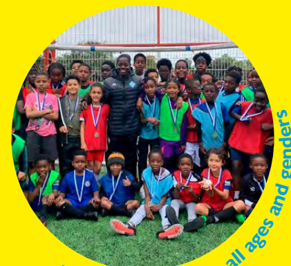
physical activity for all ages and genders