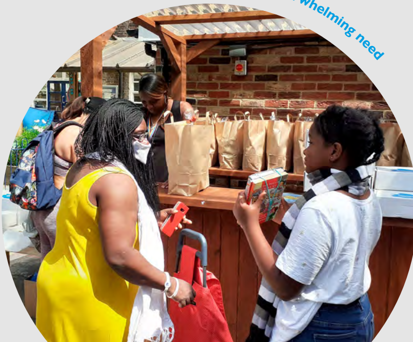
an overwhelming need