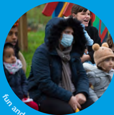
fun and safety