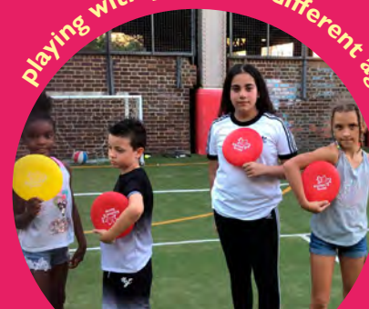
playing with people of different ages