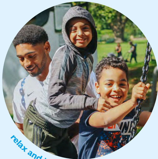
relax and join in the fun

Parents felt that attending the HAF programme means that children get to spend their time more wisely and have something positive in their life. One said simply, “[it] stops the children from being stuck at home and watching TV and allows them to socialise with other children” ; another added, it gives them “something to look forward to each week” and another, it “keeps them busy during the holiday so it doesn’t make them feel like they are missing out on anything fun”.