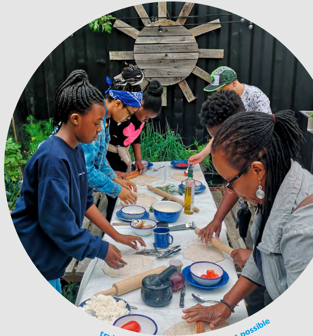
trying to reach as many children as possible

LAs want to achieve better coordination and information / good practice sharing between boroughs and there is a role to play for the GLA and MFL here. Many LAs commented that their primary source of support was MFL due to the bank of helpful support resources that has been built up since 2017 and its trusted relationships with independent and experienced staff. Some LAs expressed reservations about the support service commissioned by DfE, reporting that clarifications were unhelpful or came too late, and that, due to the close association with DfE, the forums did not feel like it was a “safe space for sharing about our challenges”. Rather, most LAs preferred to have local or regional learning events coordinated by the GLA or other regional organisations, such as MFL.