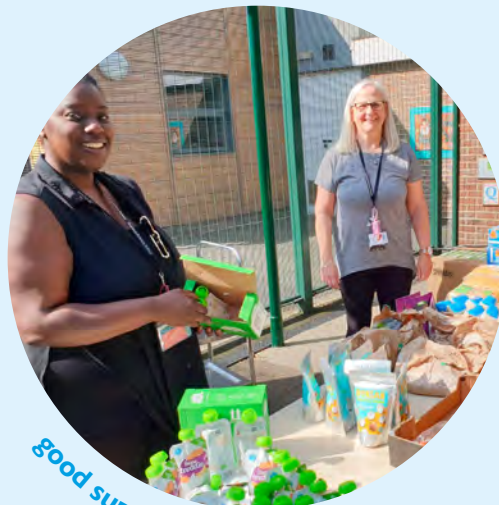
good support network

Furthermore, there were benefits for the parents who felt able to relax, socialise and even join the fun and share bonding experiences with their own children. There were many comments to the effect that,