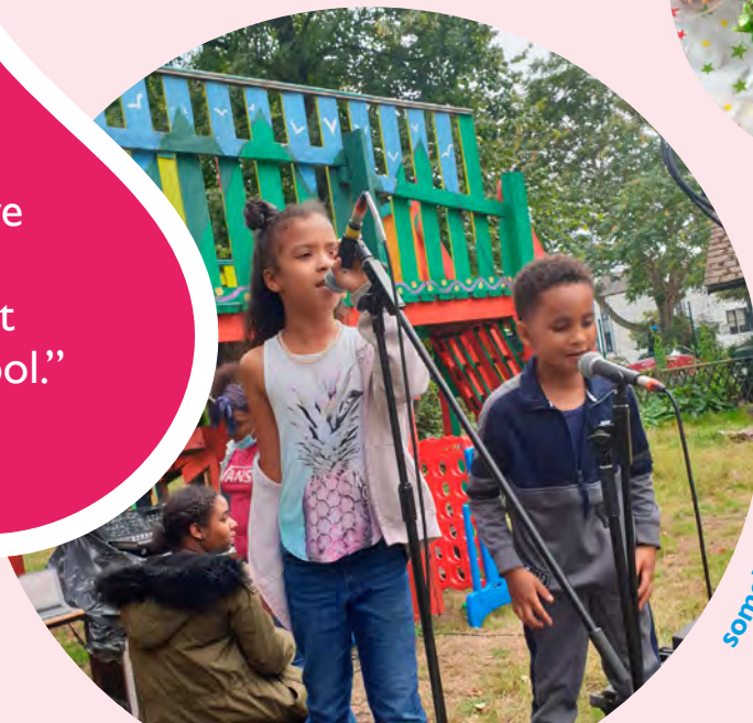
something to talk about

“ means the most – I have something to do and something to talk about when I go back to school.”