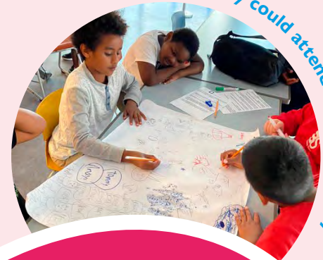
60% wished they could attend more frequently