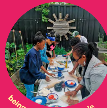
being around new people